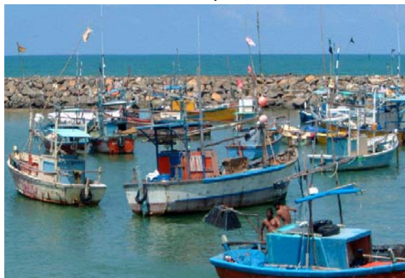
3 1/2 ton day boats