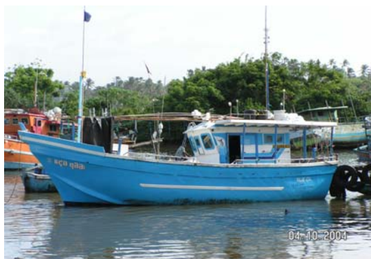
Offshore multiday boat